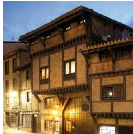
// EL PORTALÓN restaurant